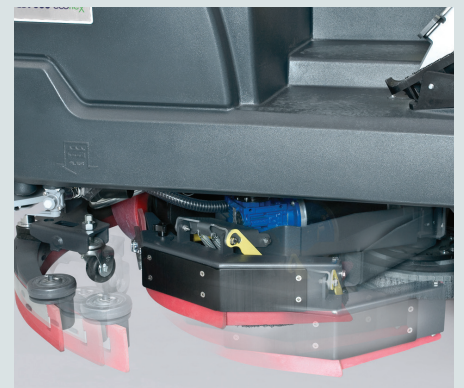
Pivoting off-set scrub deck and break-away squeegee won't be damaged if knocked by obstacles