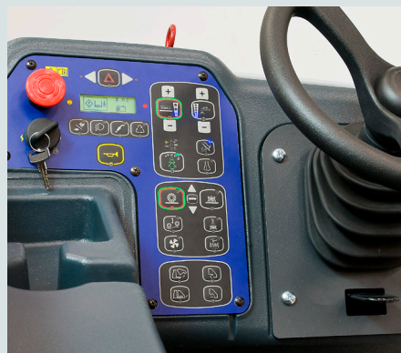
Easy to use One-Touch™ control panel