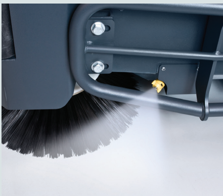
DustGuard™ system to reduce airborne dust generated by side brush sweeping up to 85%