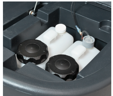
Dual Ecoflex chemical kit (optional); easy to install and immediately accessible