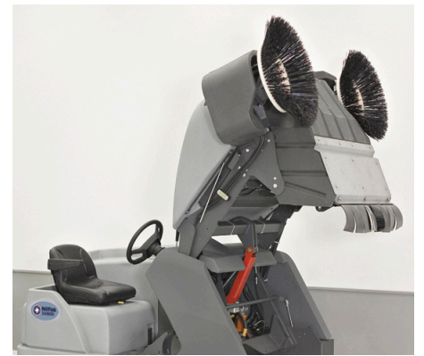
The SW8000 has a superb high-dump capability up to 152 cm from ground level for easy and convenient emptying